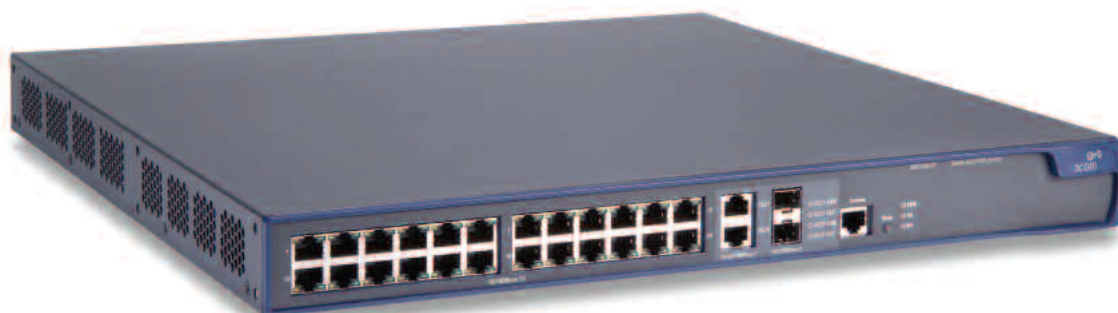
3Com Switch 4210 PWR 26-Port, Switch 4210 52-Port

Limited Lifetime Hardware Warranty, including fans and power supply Limited Software Warranty for 90 days Advance Hardware Replacement with Next Business Day shipment in most regions Limited Lifetime software updates 90 days of telephone technical support Refer to www.3com.com/warranty for details.